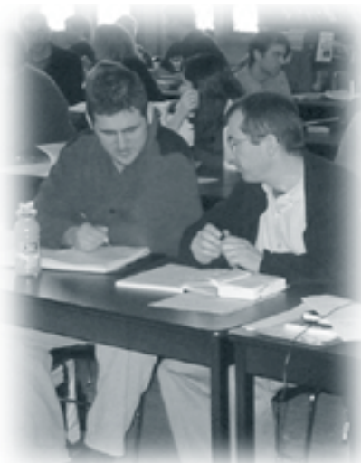
Engaged students at the seminar