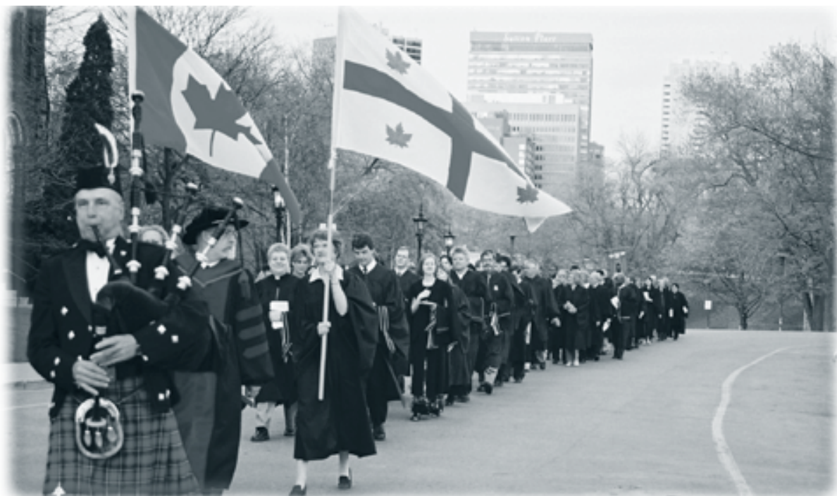
Graduates processing to Convocation Hall