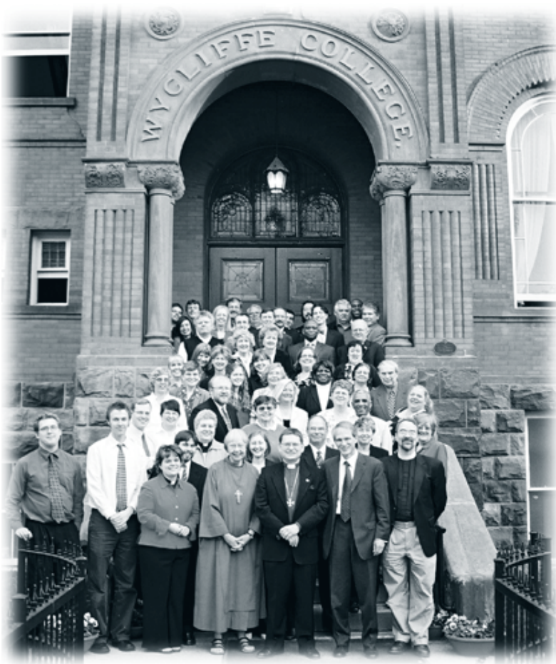
The Graduating Class of 2005

(THIS IS AN EDITED VERSION OF THE ADDRESS PREPARED BY TOM POWER. YOU CAN READ THE FULL VERSION AT WYCLIFFFECOLLEGE.CA )