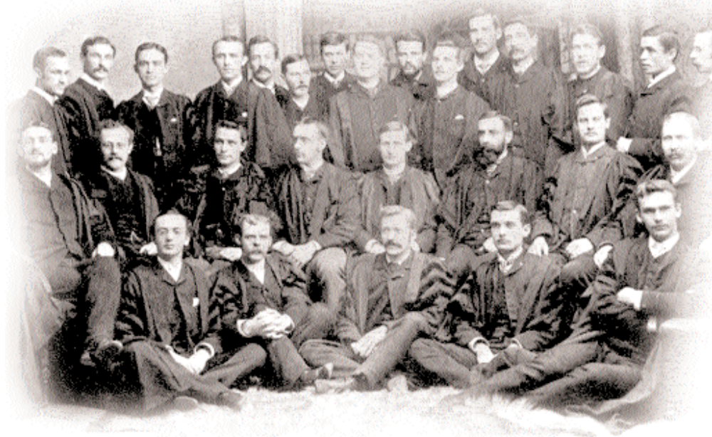
Wycliffe's First Graduation Class

This year's graduating class was the largest in recent memory — the graduates of 2002 are: