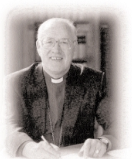
Dr. George Carey, the Archbishop of Canterbury

INSIGHT The Wycliffe College Newsletter for Alumni/ae and Friends June 2002 No. 52 ISSN 1192-2761